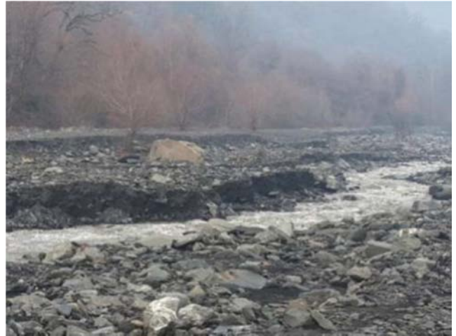
Figure 5. Alluvial material of the Duruji River.

The detrital cone of the Duruji River, covered with blackish slates (area of 10 \times 6.5 \text{ km}^2 ) is considerably heated by the solar radiation during a day. The same can be said about the gorges of the Chelti and Bursa Rivers. For this reason, in this micro zone the soil temperature and air temperature are by 2\text{-}3^\circ\text{C} higher than the temperature of the adjacent places. On the other side of Alazani River there are Napareuli, Kindzmarauli and Kvareli micro zones famous for their high quality wines.