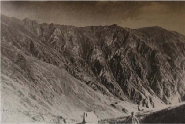
Figure 2. Source of the Duruji River – Shavi Klde.

Klde, there are developed long and wide hollows, in which the exposed solid materials are continually moving down. A large amount of the weathered loose material is also accumulated in the Tetri Duruji River bed (Figures 2, 3, 4, 5).