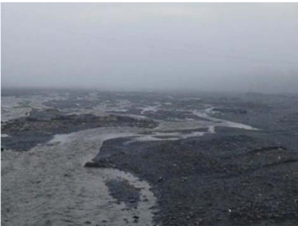
Figure 4. Alluvial material of the Duruji River.