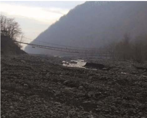
Figure 3. The Shavi Duruji River.

The micro zones of Kindzmarauli and Naphareuli vineyards include detrital cones of the Duruji River. The detrital material is creating the unique conditions for producing wines of high quality.