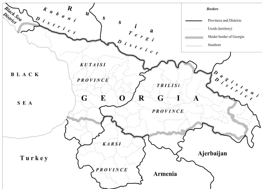
Figure 1. Georgia in a Russian Empire (end of the XIX c.).

Under the Peace Agreement between the Russian Soviet Federal Socialist Republic (RSFRS) and Democratic Republic of Georgia (of 07.05.1920), Russia recognized the “Identity and independence of the State of Georgia” and willfully waived all its rights usurped by it by violating the Treaty of Georgievsk (1883) and abolishing Kartli-Kakheti Kingdom. Under article 3 of the Agreement, the border started on the Black Sea, at the confluence of the River Psou, followed the river up to Mount Asakhcha (2315,2 m asl), reached Mount Agepsta and by running along the Main Ridge of the Greta Caucasus, followed the northern border of the Black Sea Okrug, Kutaisi and Tbilisi Provinces, the territorial units included in the former Russian Empire. From this point, the border ran to Zakatala District and by following its eastern side, reached the Armenian border. Under article 2 of the same Agreement, all passes along the border were recognized neutral and the armies of the negotiating parties were forbidden to occupy or reinforce them (before January 1, 1922). The neutralization zones of the passes were fixed calculated for the distance of 5 versts in both directions from the border point. An exception was some passes, e.g. in Dariali gorge, the zone covered the area from Balta to Kobi and it spread from Zamaragi to Oni across Mamisoni Pass [8].